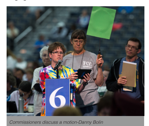
Two-state solution for Israel-Palestine reaffirmed

By a 31-25 vote, the Assembly Committee on Immigration and Environmental Issues had recommended divestment. Commissioners wound up voting for a substitute to maintain investments and corporate engagement, 460-91.